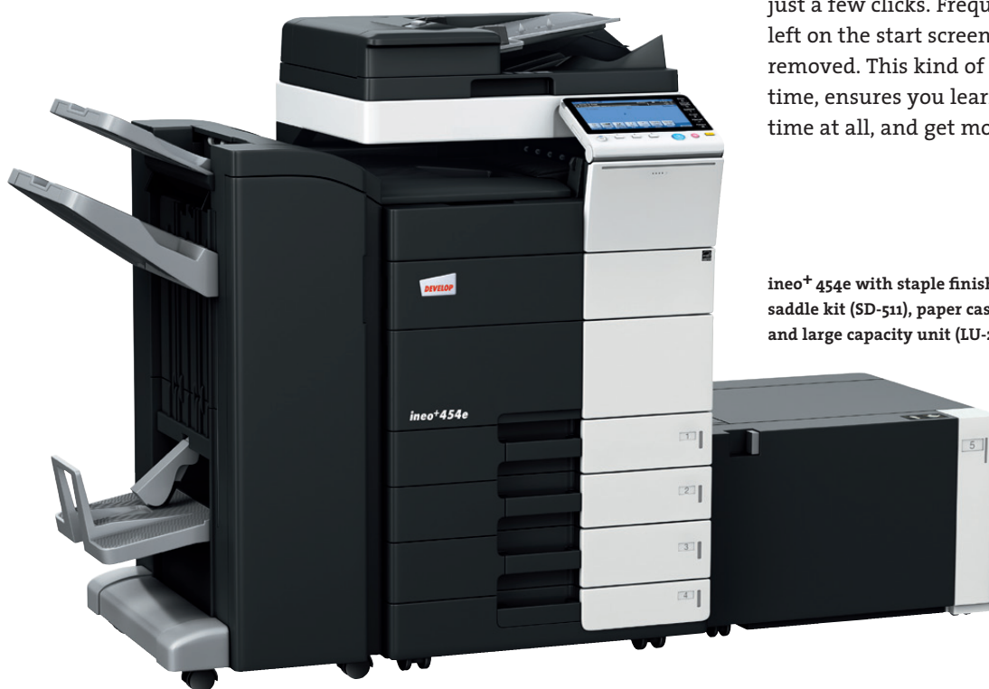
ineo+ 454e with staple finisher (FS-534), saddle kit (SD-511), paper cassettes (PC-210) and large capacity unit (LU-204)

Many multifunctional office systems are anything but user-friendly. The ineo+ 454e, in contrast, is simplicity itself. An intuitive, easily understandable operating concept ensures that it is as easy to use as your smartphone or tablet. The 9-inch capacitive touchscreen comes with well-known multi-touch operations such as flick, drag&drop or pinch in&out. Thanks to a new menu navigation structure you can also see all functions in one go and select the settings you want with just a few clicks. Frequently used functions can be left on the start screen and ones you don't use simply removed. This kind of customisation saves you lots of time, ensures you learn to operate the system in no time at all, and get more fun out of routine office jobs.