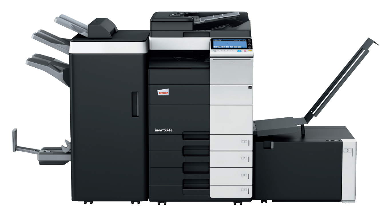
ineo<sup>+</sup> 554e with staple finisher (FS-535), saddle kit (SD-512), job separator (JS-602), paper cassette (PC-210), large capacity unit (LU-204) and banner tray (BT-C1e)