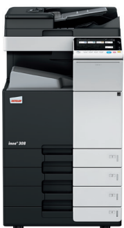
ineo+ 308 with dual scan document feeder (DF-704), output tray (OT-506) and paper feeder (PC-210)

Invest in an ineo+ 308 and you will no longer be dependent on external shops for specialist jobs such as invitations printed on thick, high-quality paper. That will save you time and money. The ineo+ 308 can handle envelopes, recycled paper, pre-printed paper, overhead transparencies, many other media and even thick card of up to 300 g/m 2 . These systems can print broad range of paper formats from A6 to A3+ (SRA3) or user-defined formats and banners of up to 1.2 metres in length. What's more, the numerous finishing options allow booklets of up to 80 pages to be created, letters folded in various ways, hand-outs stapled or invoices hole-punched. Almost any job can be produced in-house on an ineo+ 308.