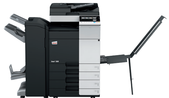
ineo+ 308 with dual scan document feeder (DF-704), staple/booklet finisher (FS-534SD), banner tray (BT-C1e) and paper feeder (PC-210)