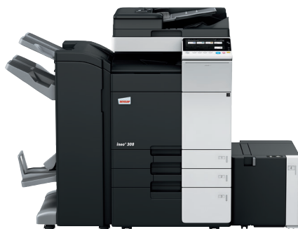
ineo+ 308 with dual scan document feeder (DF-704), staple/booklet finisher (FS-534SD), large capacity tray (LU-302) and paper feeder (PC-410)