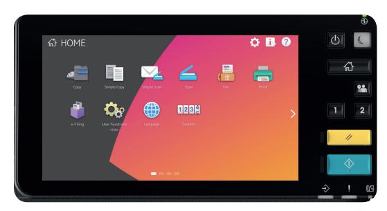
Customised display with up to 18 icons per page and with a different background

The optional embedded OCR adds to the already extensive list of functionalities the new Toshiba systems have to offer. By easily converting hard-copies into editable and/or searchable documents, intelligent document management is taken a step further. The converted documents are automatically created, shared and forwarded to a location of your choice. And all this happens via the MFP without the need of an additional server.