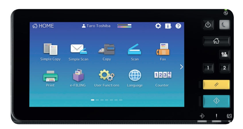
A large touch screen is your gate to document handling which has never been easier. Size and order of icons as well as the background image can be customised. Enjoy the unique experience of working with a system that understands what you want.