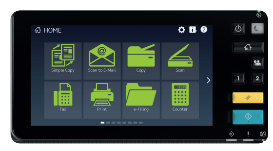
Display icons as buttons to easily access functions or start workflows.